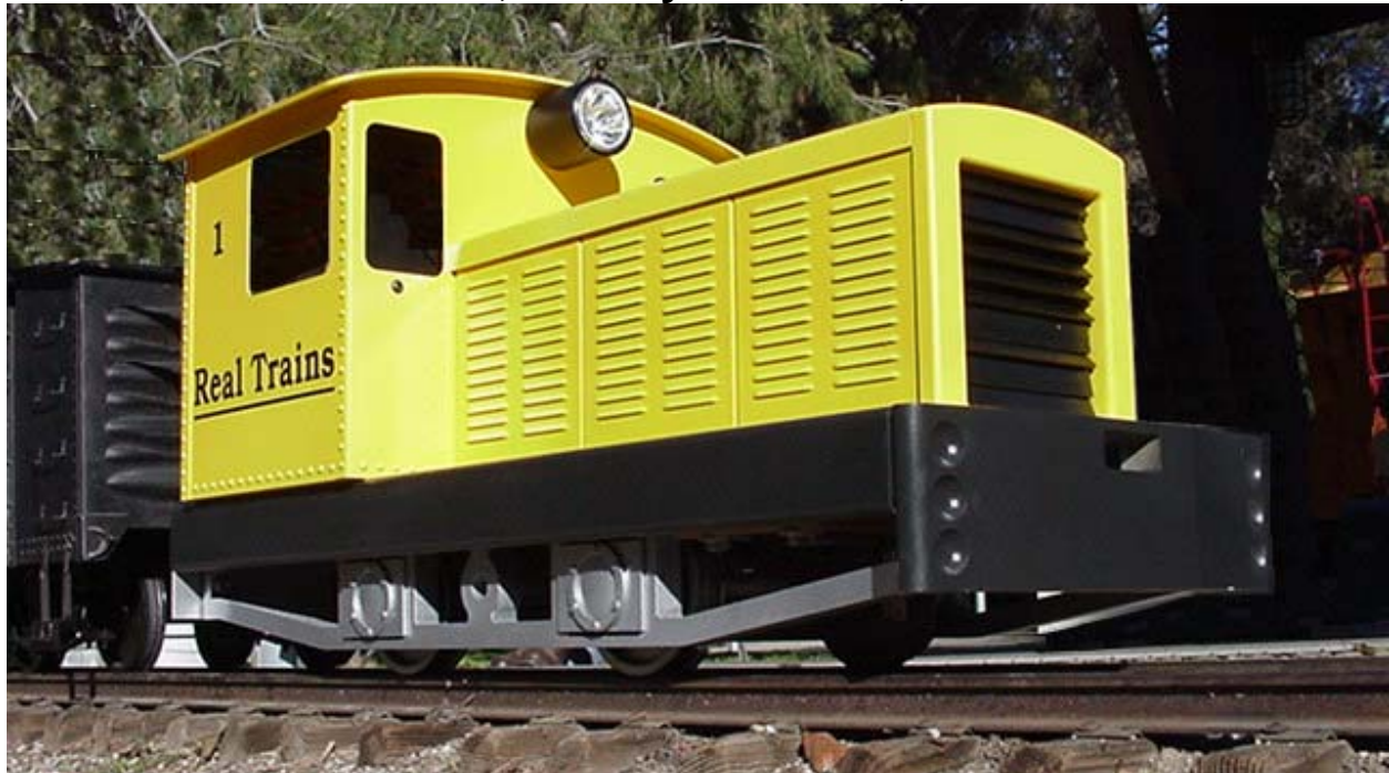
Some Items Shown are Optional at Extra Cost

A highly affordable first locomotive for someone new to the hobby. Also popular for work trains or as a less complex alternative for that junior engineer in the family. Designed to last for years with little maintenance.